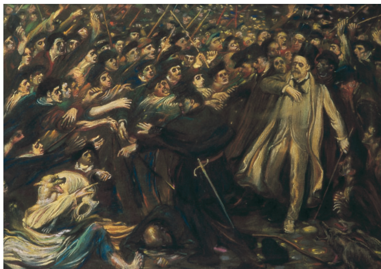
▲ Zola Under Attack , painted in 1898 by Henry de Groux, shows Émile Zola surrounded by an anti-Semitic mob.

In 1894, Captain Alfred Dreyfus, one of the few Jewish officers in the French army, was accused of selling military secrets to Germany. A court found him guilty, based on false evidence, and sentenced him to life in prison. In a few years, new evidence showed that Dreyfus had been framed by other army officers.